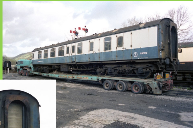
On arrival at Bronwydd Arms 23rd March 1990 →