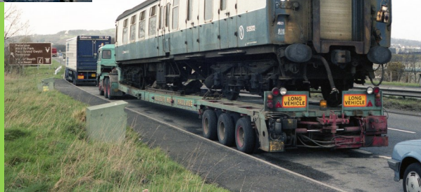
← 35012 en-route to the Gwili Railway still with its lamp attached 23rd March 1990