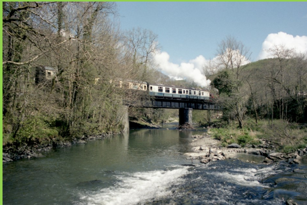
← 35012 crossing the River Gwili at Llwyfan Cerrig on April 1st 1990